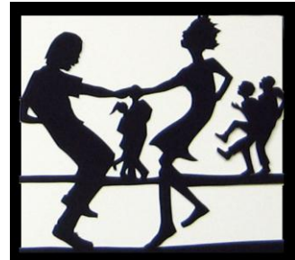
Beatrice Coron "Swing"