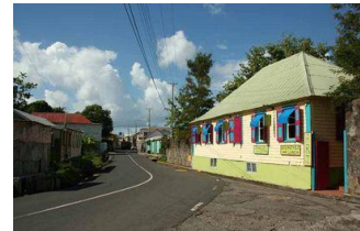
Terry Boddie "Main Street"